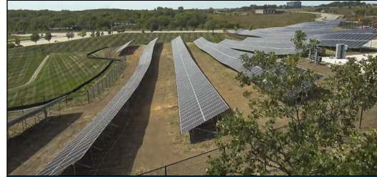
AFTER: Wells Fargo's Des Moines, IA - Jordan Creek Campus West Solar Array

Wells Fargo aims to meet its energy goals in a way that curbs climate change. We believe you can protect the planet and grow the economy at the same time. By significantly expanding our onsite solar generation, we are delivering impact at the local level and helping to accelerate a just transition to a low-carbon future.