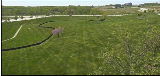
BEFORE: Wells Fargo's Des Moines IA - Jordan Creek Campus West