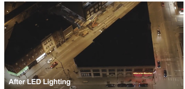
After LED Lighting