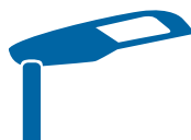
SMART STREET LIGHTING